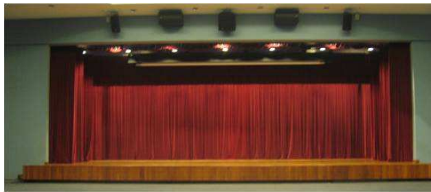
Front view of stage