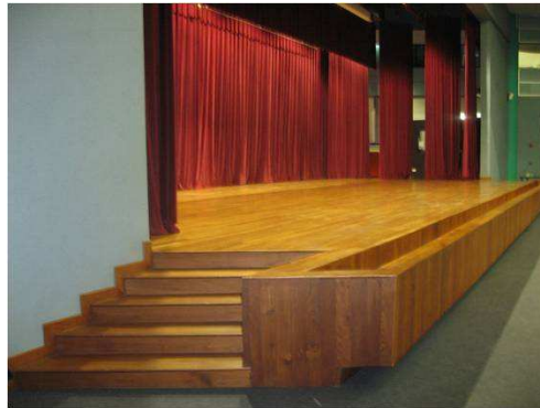
Side view of stage

Pictures and Dimensions of Annexe Hall 1 stage (For Finals):